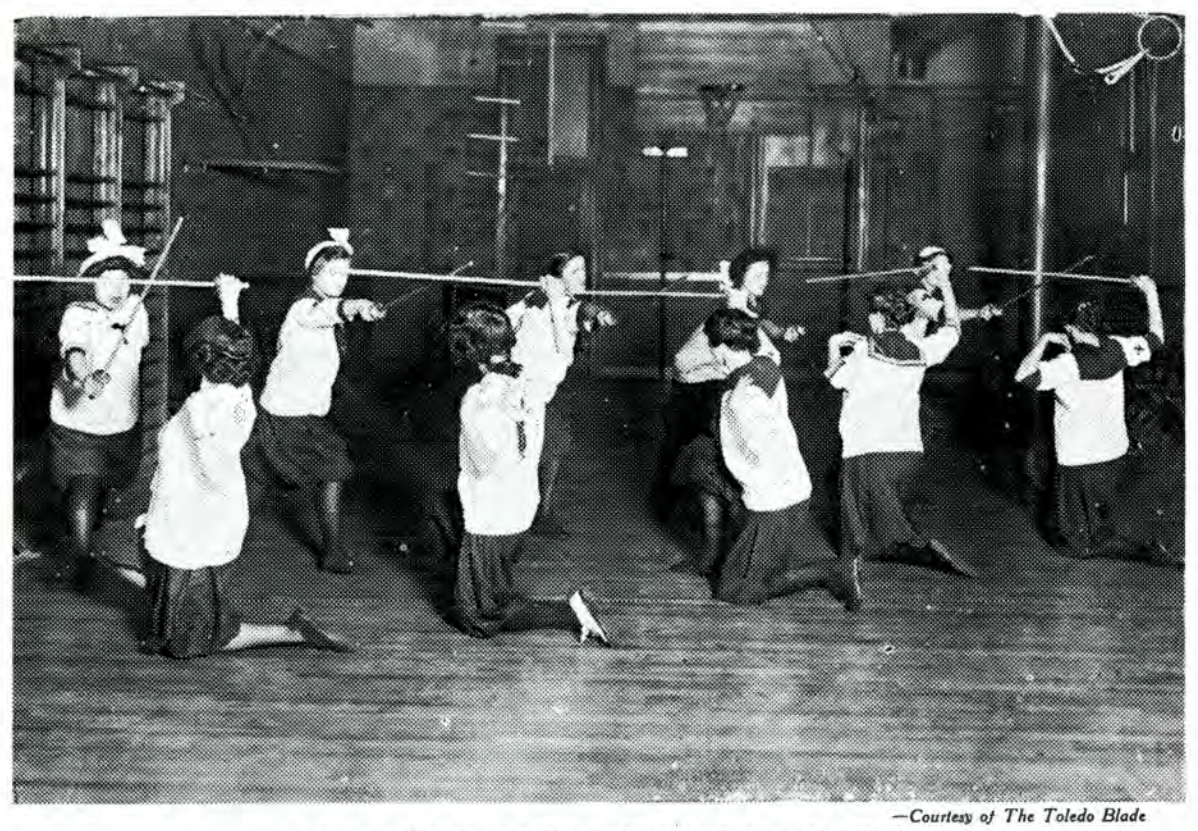
A Glimpse of the Physical Training Work for Girls in "Our Club"

"OUR CLUB" gymnasium is the most perfectly equipped woman's gym in Toledo. The girls earned the money and furnished the gymnasium---themselves.