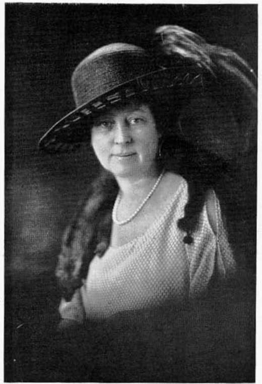
Woman's Club recent membership campaign which was so highly successful.