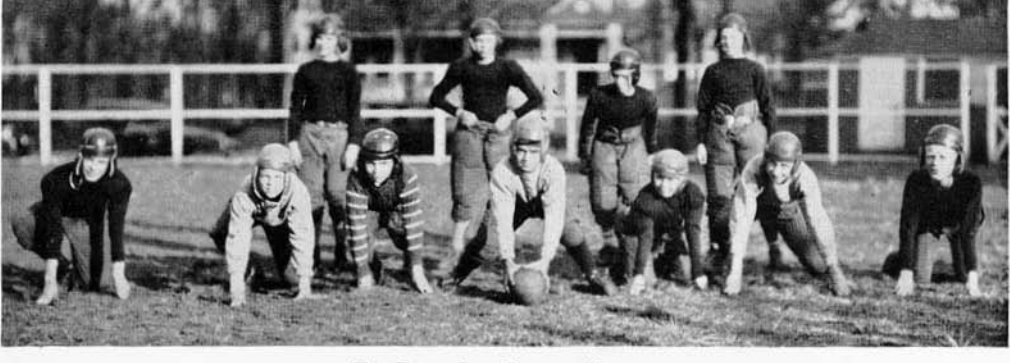
THE DEMON JANES-FRANKLIN ELEVEN