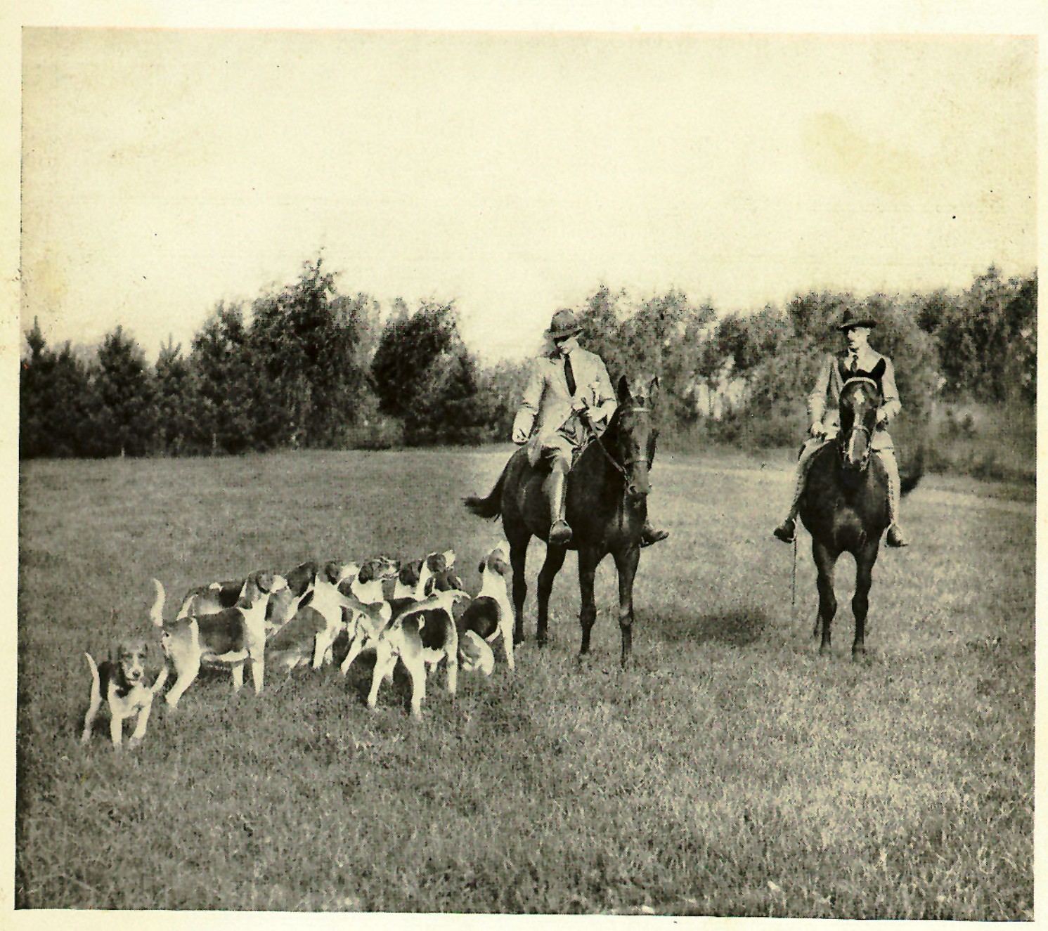
Ottawa Hills Drag Hunt