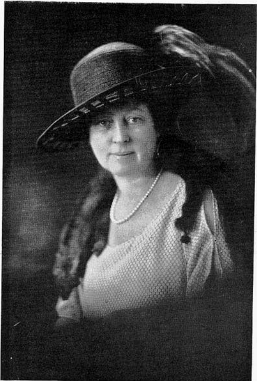
Woman's Club recent membership campaign which was so highly successful.